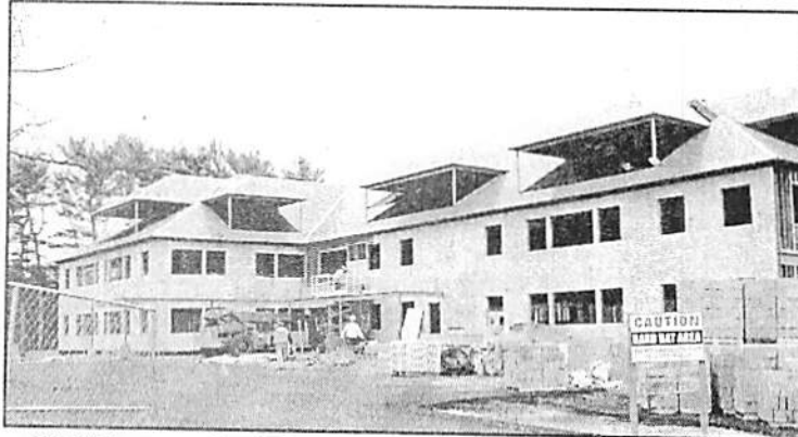
... 36,000 square foot Standish Partners Medical office building on Tremont Street ...